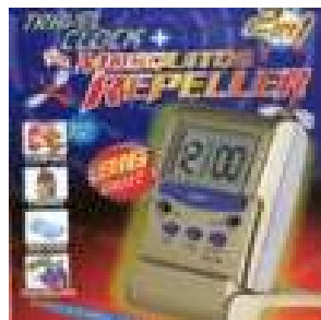
Mosquito Repellent Clock