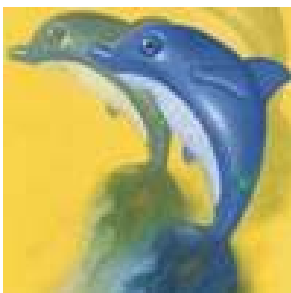
FM Radio Shower

Till date, the company has focused on commercialising ideas which have originated internally in the space of consumer products and more specifically in the space of 'Small Consumer Electronics'.